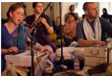
The 24 hour kirtan held at the Balaji Temple in Dudley near Birmingham took place on the weekend of the 2nd and 3rd of June this year.

The most recent festival was in the Ilford Town Hall, promoted by the devotees of the ISKCON Redbridge Centre. The huge hall, with a capacity of at least 600, was filled to the brim and the event was a resounding success.