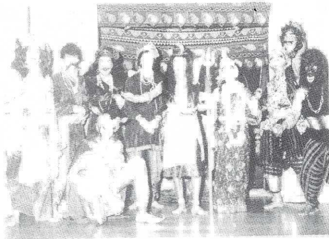
The Manor's theatre group perform dramas depicting the rich tradition of India's Vedic culture.