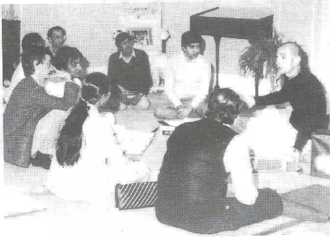
Special study classes on Bhagavad Gita.