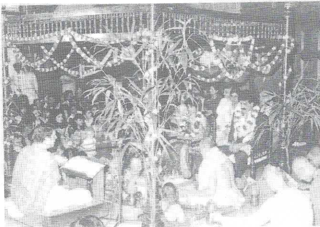
Weddings are held at Bhaktivedanta Manor.