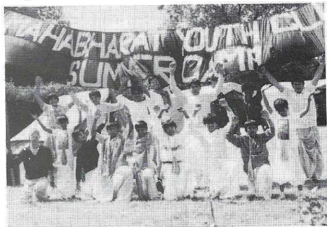
Summer Camps are held each year for boys and girls.